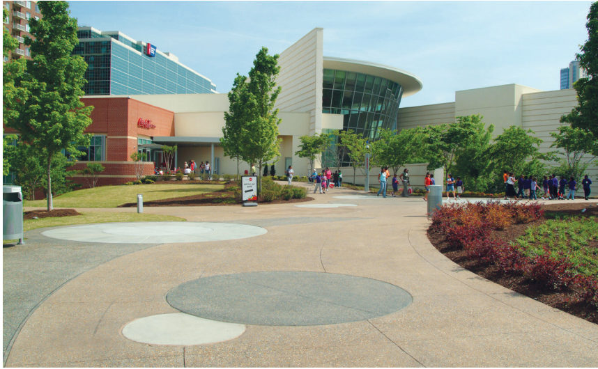
Artevia® was used in the construction and design of World of Coca-Cola in Atlanta, GA.